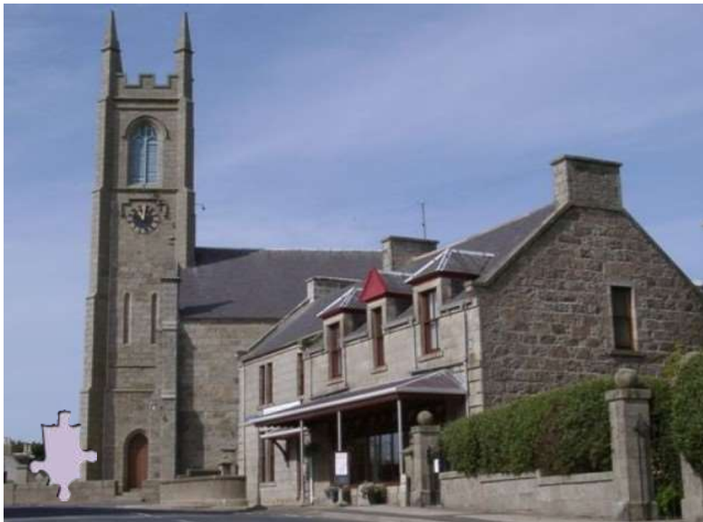
The Church Centre, Mustard Seed Cafe and St Kane's Church

The Mustard Seed Cafe fronts the Centre and is a terrific vehicle for outreach into the local and wider community. Managed and operated by volunteers, the cafe not only caters for locals and passing trade, but is used regularly by 'Buchan Dial a Community Bus' for outings, Toddlers' lunches and a Lunch club. There are a variety of Christian books and items available for sale in the Cafe through CLC and quizzes and items to support local charities. We provide the Traidcraft catalogue for orders throughout the year. The cafe is open 5 days a week.