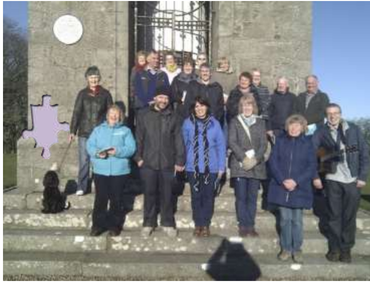
Easter morning 2014